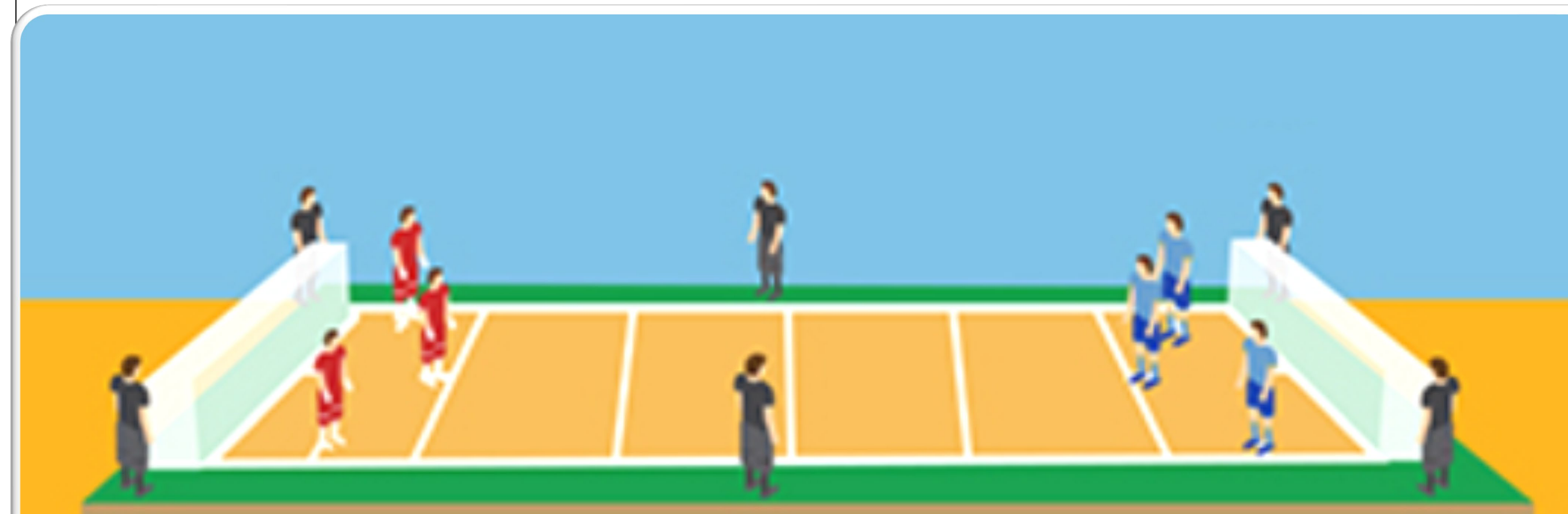
The Goalball court is the same size as a standard volleyball court, measuring 9m x 18m